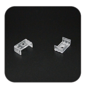
Mounting Clip (PC)